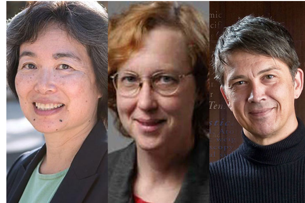
Three faculty elected to National Academy of Engineering