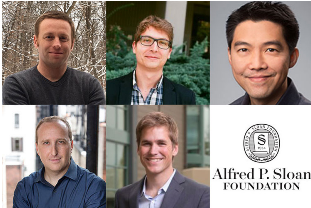
Sloan fellowships awarded to five faculty 'rising...